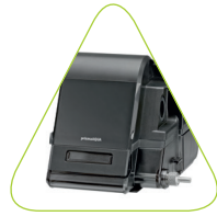
prismaAQUA – WM 29680 Humidifier