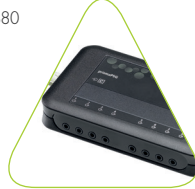
prismaPSG – WM 29690 PSG Module