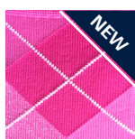
PINK ARGYLE (45)