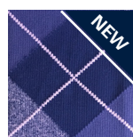
PURPLE ARGYLE (46)