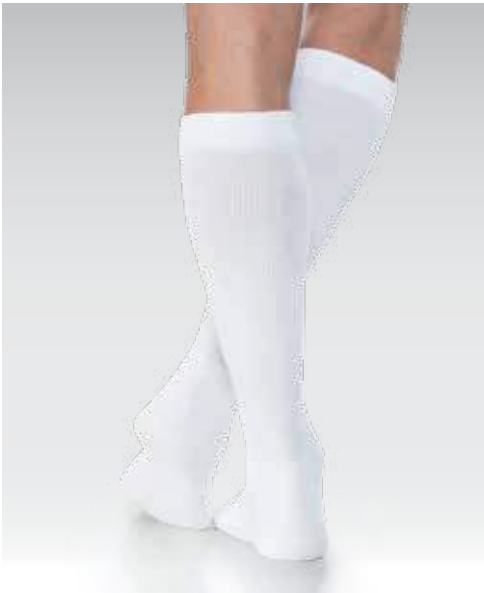
8–15mmHg Closed Toe Calf Size Large in White 160CL00