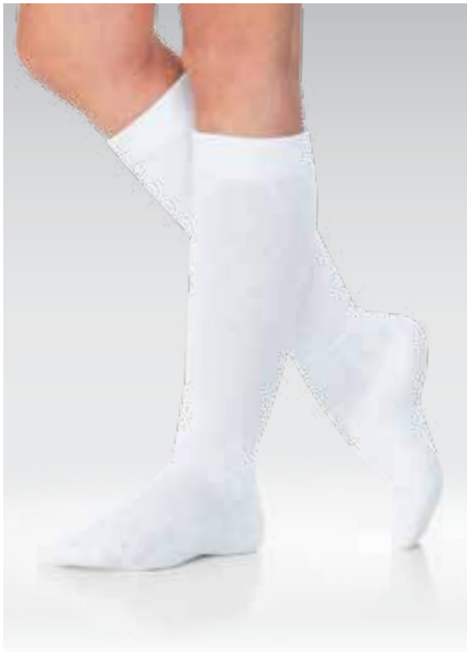
8–15mmHg Closed Toe Calf Size Small in White 160CS00