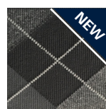
GRAPHITE ARGYLE (47)