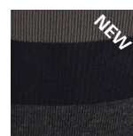
DARK NAVY STRIPE (13)