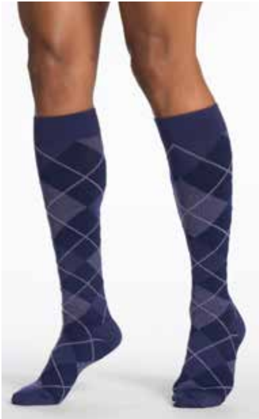
20–30mmHg Closed Toe Calf in Purple Argyle