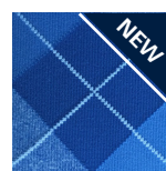
ROYAL BLUE ARGYLE (48)