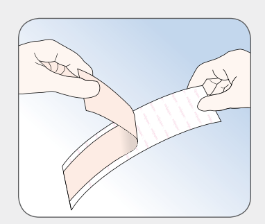
Remove the protective release film.