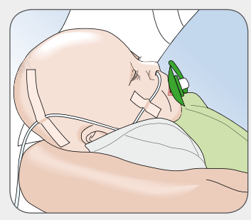
Apply Mepitac® without stretching. If inspection or repositioning is necessary, Mepitac® can be lifted and reapplied.