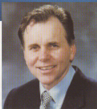
Barry Marshall, M.D. Nobel Laureate

Designed by Gastroenterology Professionals for Rapid Results and Ease of Use