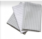
4Way Slide Sheet