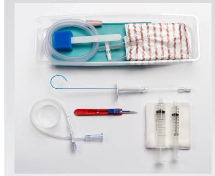
R58800-06-BK Rocket BLUE™ Drain Ward Procedure Pack

For insertion into, but not restricted to, the abdominal cavity, chest and urinary bladder using a 'direct stab' technique combined with aspiration and/or ultrasound guidance.