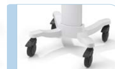
Model Shown here with hospital-grade wheel option

Accessory Choices: AHA, IEC, reusable/disposable electrodes