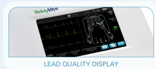
LEAD QUALITY DISPLAY

No need to track between the display and keyboard, saving time and helping reduce errors.