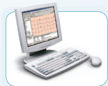
Welch Allyn CardioPerfect Workstation