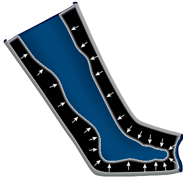
Consistent Inward Pressure

Overlapping internal chambers eliminate uncomfortable 'pinch points'.