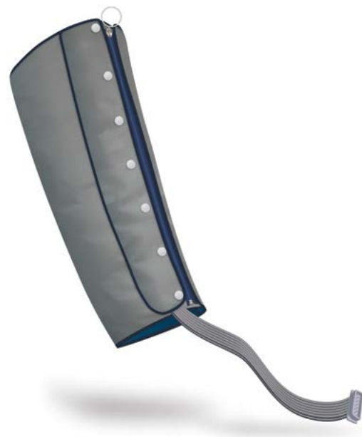
Twelve Chamber Arm Garment

Clinical evidence - Intermittent Pneumatic Compression (IPC) and Manual Lymph Drainage provides a synergistic enhancement of the effect of Complex Decongestive Physiotherapy (CDP).