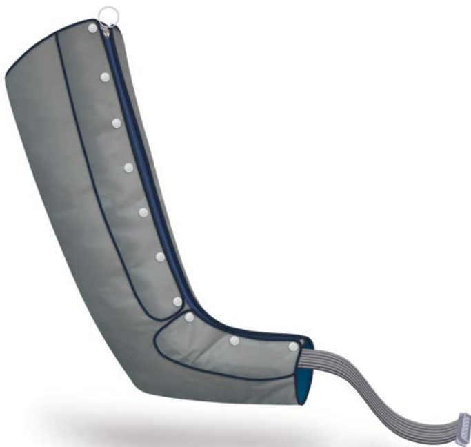
Twelve Chamber Leg Garment