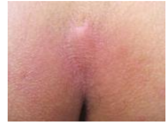
Pressure Injury Stage 1 -Non blanchable

Sudocrem will provide a barrier against sweat, urine and faecal matter, soothe the irritated area and heal under the barrier. (JBI Best Practice Vol.11, Issue 3 2007)