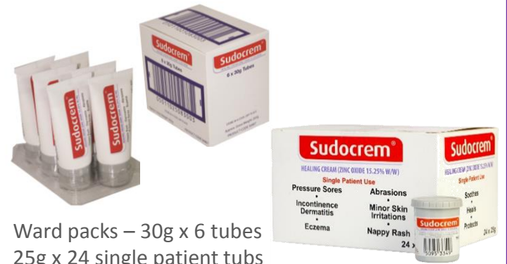
Ward packs – 30g x 6 tubes 25g x 24 single patient tubs