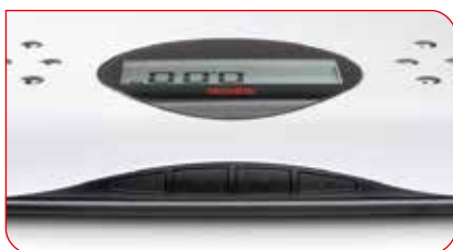
The cleverly positioned buttons can't be accidentally activated while the scale is being used.