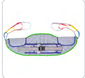
Deluxe Padded Standing