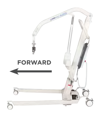
This is the direction of travel for which this lifter has been designed.

The correct and appropriate use of the ASPIRE A205 Lifter reduces the risks associated with manual patient handling. The lifting and transferring of patients should always be assessed and planned by a trained health professional.