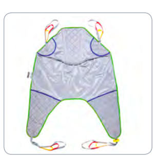
Deluxe General Purpose with Head Support