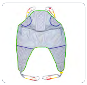
Mesh General Purpose with Head Support