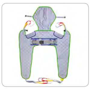
Deluxe Access/Hygiene with Head Support