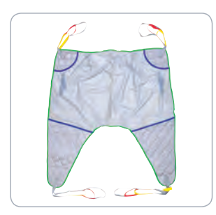
Mesh General Purpose