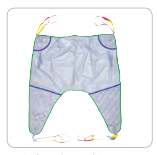
Deluxe General Purpose

This lifter may also be suitable for use with other brands of slings provided that the design is compatible with a hook yoke/spreader bar design. To confirm if a sling is compatible with any of the ASPIRE range of lifters, contact AIDACARE on 1300 133 120.