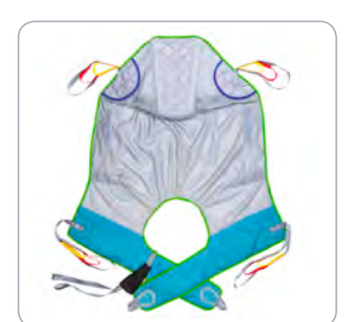
Deluxe Hammock Slings (Mesh & Super Soft Fabric Available)