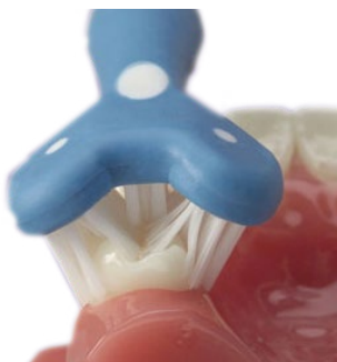
27120 / Surround Toothbrush