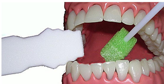
90008 / Sage Open Wide Mouth Props