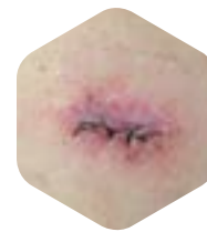
Infected Post Op Wounds