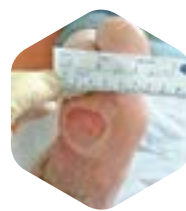
Diabetic Foot Ulcers