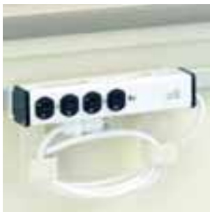
4-outlet electrical strip