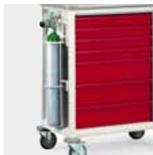
Oxygen tank holder