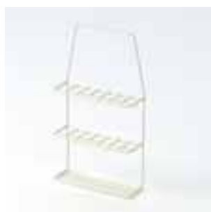
Chest tube rack