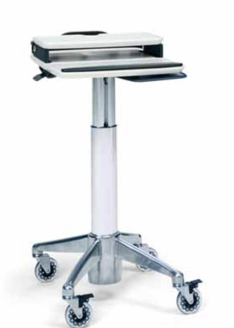
Mobile Technology Carts