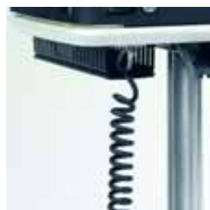
Coiled power cord