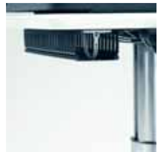
Cable management holder