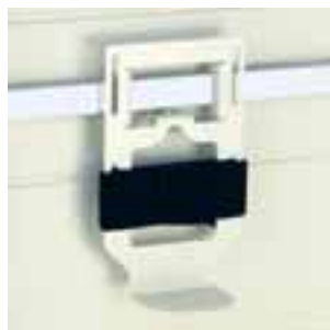
Sharps container holder