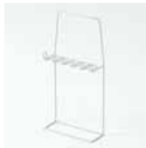
Fogarty catheter rack