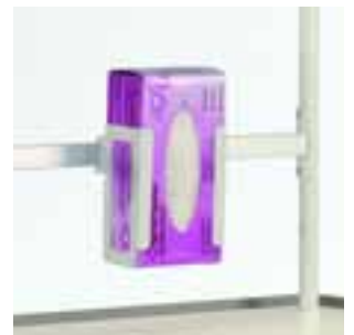
Glove box holder