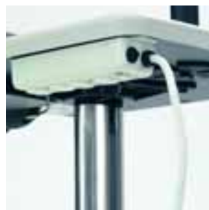
Power distribution strip