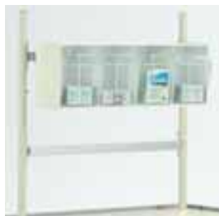
Tilt-out storage bin