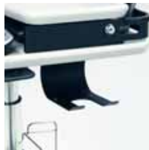
Bar code scanner holder